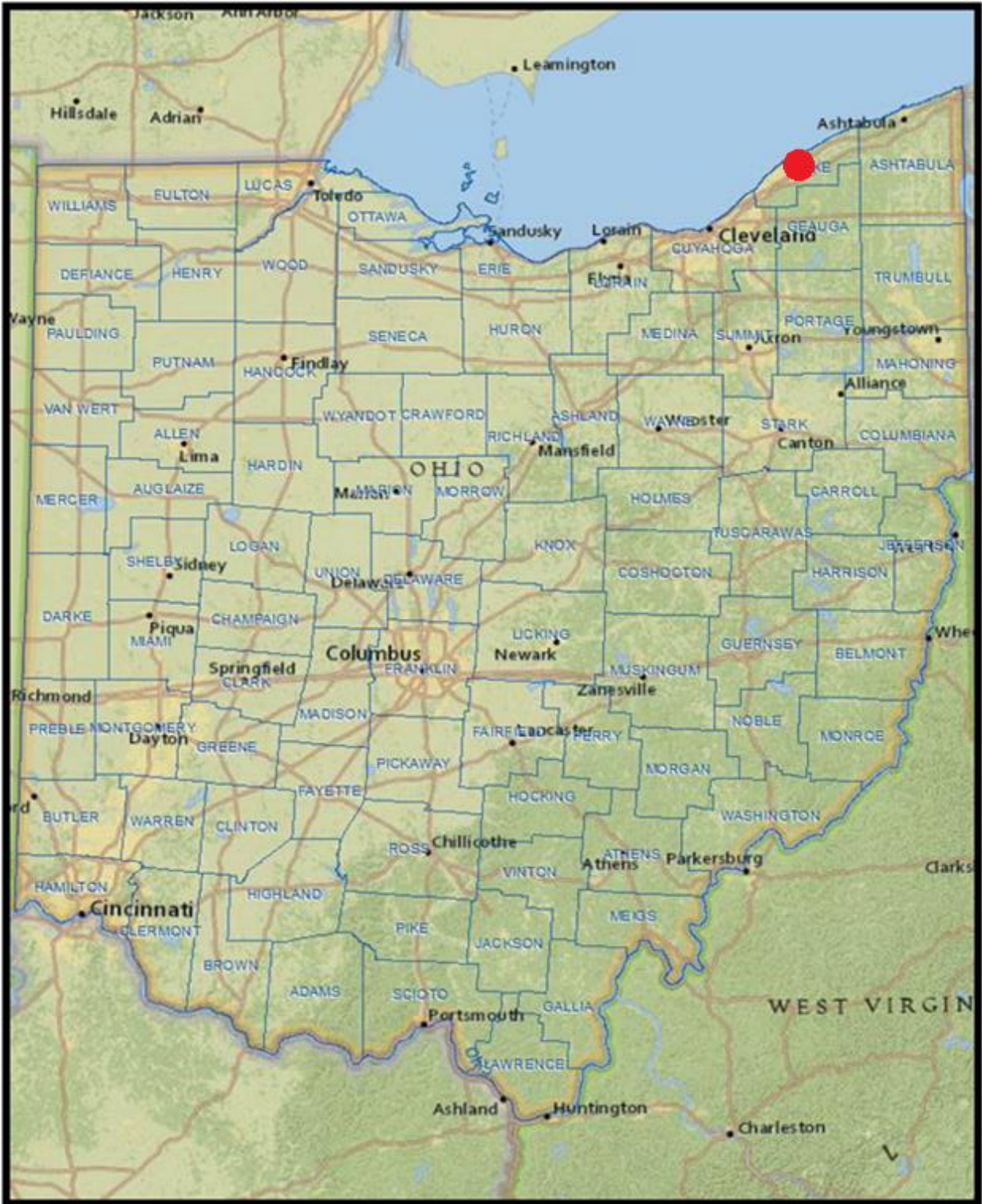
Figure 1: General project area