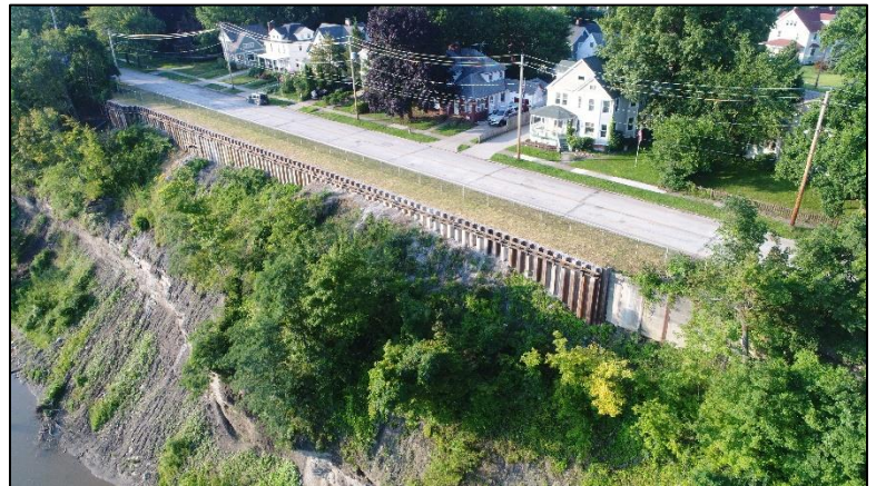
The completed shoreline stabilization project along Bank Street and the Grand River in Painesville, Ohio.